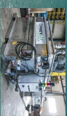
Portable oily water separators