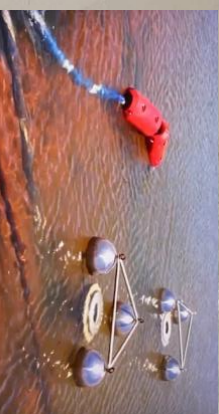
Self adjustable weir skimmers