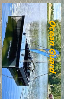
Remote control in-situ oil skimmer Floating Oil-Water-Separator