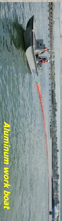
Aluminum work boat

OZ-SEPA nano membrane fabric In-situ oil- Zero separator