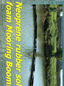
Neoprene rubber solid foam Mooring Booms